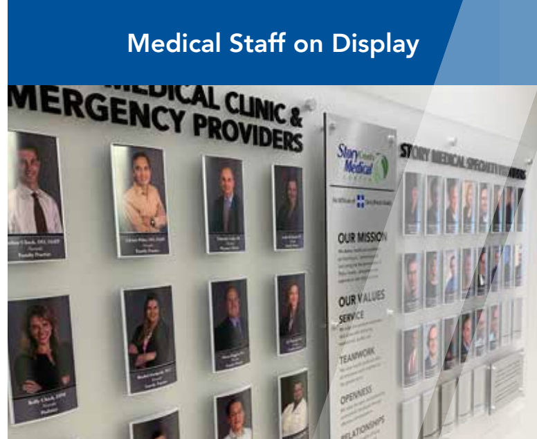
Medical Staff on Display